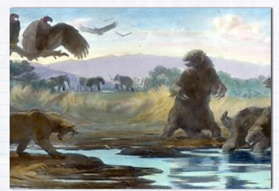
Rancho la Brea Tar Pool. Restoration by Chas. R. Knight for Amer. Mus. (N.Y.), 1921.