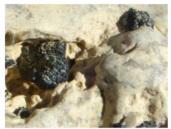
One of my specimens.

ed a fire under me. I got on the internet and looked up vivianite. I called and corresponded with Tennessee state geologists, and one of them indicated that there were only two previous occurrences of vivianite in Tennessee. One location didn't exist anymore, and the other location had not been recorded.